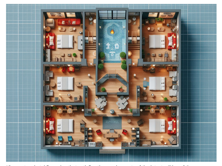
"Generate a hotel floor plan that satisfies the requirements of the latest edition of the Massachusetts Fire Code." Generatd with Bing Image Creator.

As a general practice guideline, Al uses should be discrete and involve specific requests rather than long, complicated inputs. For example, the Al guery "generate a hotel floor plan that satisfies the requirements of the latest edition of the Massachusetts Fire Code" may generate a design that appears to satisfy the relevant code. However, it is not recommended to directly convert these results into construction documents. Given the nature of current generative Al (i.e., it may be trained on vast, uncurated datasets, including the entirety of the Internet), it is possible that the result generated is based on an outdated code version. While there is a trend toward using curated datasets, which are more reliable, these come at a significant cost. Furthermore, despite using carefully crafted queries, the risks remain: the Al-generated responses may miss critical amendments or revisions to the code, or produce designs that ultimately fail to comply with current regulations. Although Al-generated results can serve as a useful starting point for design exploration, they require thorough independent verification against the actual code to ensure compliance.