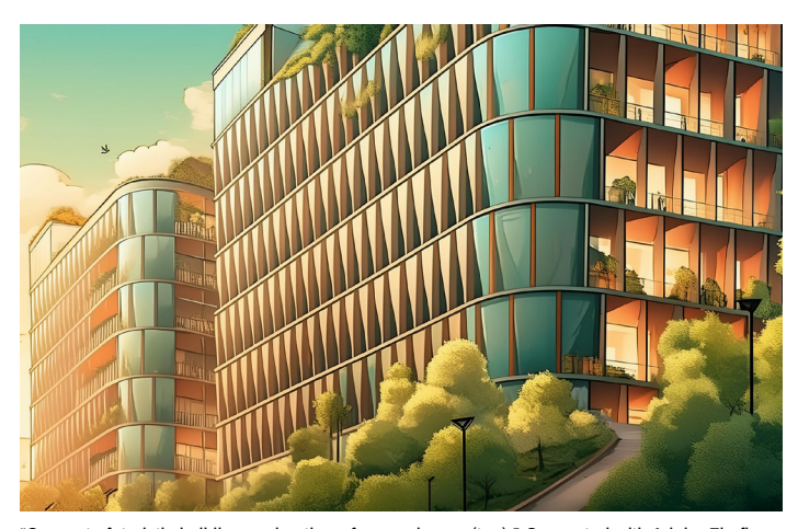
"Generate futuristic buildings using the reference image (top)." Generated with Adobe Firefly.