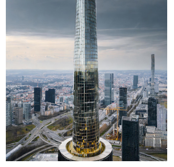
"Generate an image of a modernist skyscraper overlooking a cityscape." Generated with Bing Image Creator (left) and Adobe Firefly (right).